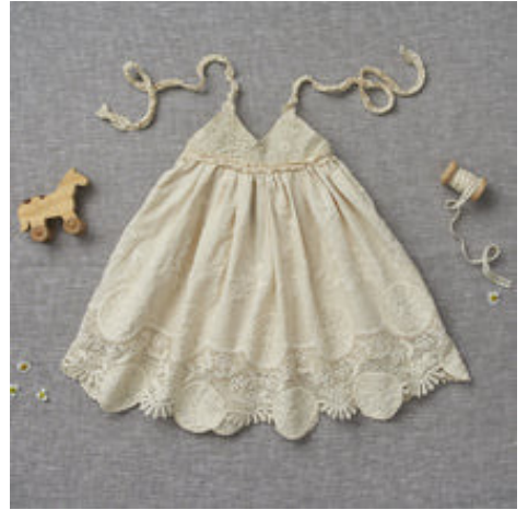
Antique Lace Dress 2/3/4