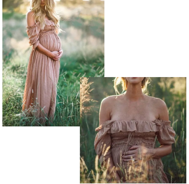
Julia Strapless Boho in Antique Pink - M