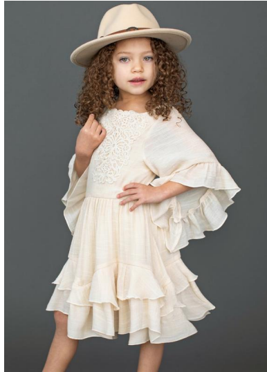
Calyssa Cream 3T