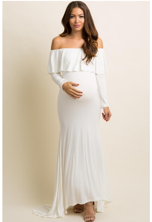
Ivory - M