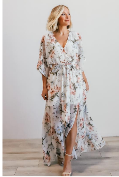
Andy White Floral Kimono –S,M,L