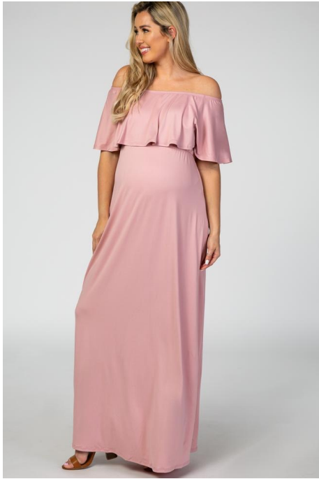
Soft Mauve - M