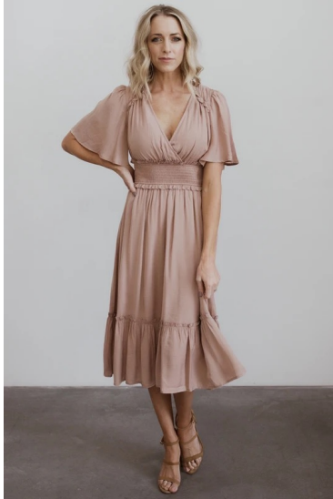
Rachel Mauve Midi – M,L