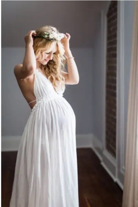
Audrey White Halter Maxi - M, XL