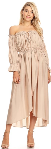
Anna Strapless Boho in Beige - S,M,L,XL